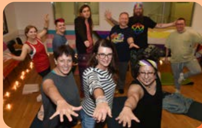
Queer Yoga North

Our next Pitching for Purpose event will be held on Wednesday 20th March 2024 at Play Brew Co Middlesbrough.