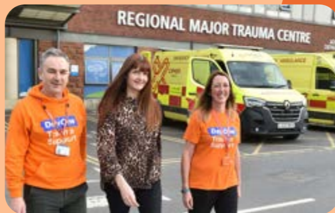
Day One Trauma Support

Book online at teessidecharity.org.uk/events/pitching-for-purpose-2024